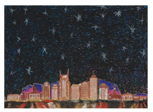
From Nashville Time 2021 music video for Sara Trunzo - one continuous drawing in cardboard relief, colored pencil, and oil pastel