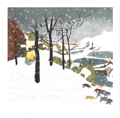
Bonfire in the Snow after Bruegel - 10 sequential gouache pochoir paintings for Maine Craft Portland winter 2021-22