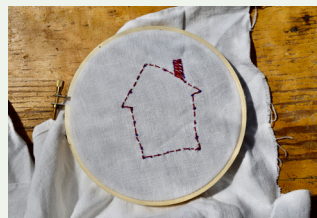
Running Stitch for house outline