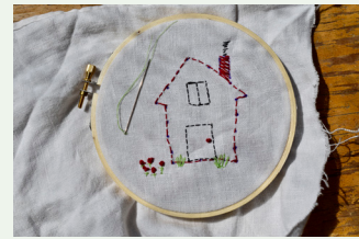
French knots for flowers and doorknob